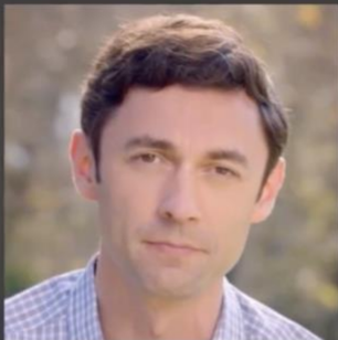
SEN. JON OSSOFF 202-224-3521