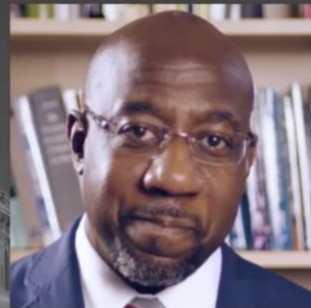
SEN. RAPHAEL WARNOCK 202-224-3643