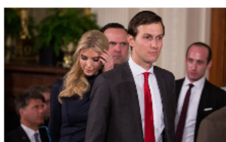
*Kushner Exposed Meeting With Russian Bank - Senate Announces Investigation