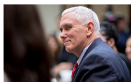
CBS News Uncovers Extremely Shady Mike Pence/Russia Connection - Buckle Up