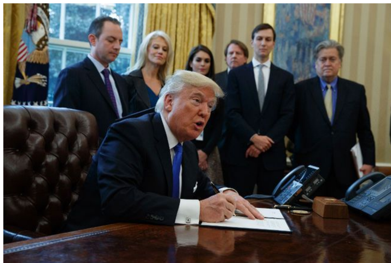
No more funds for Abortion-promotion organizations

He also signed an executive order on Monday barring federal funds from organizations that promote abortion around the world, including the International Planned Parenthood Federation, in what activists say is the president’s first major pro-life action while in office.